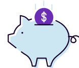
HSA / FSA SUPPORT

Chat with us today by logging into the HealthJoy app or call (877) 500-3212